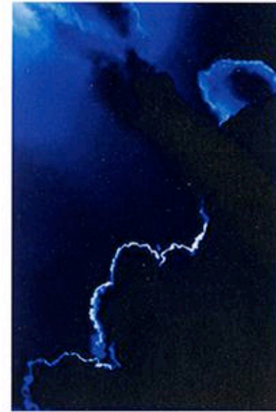
Athmos #06 60"x 40" Digital Print on Canvas